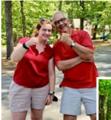
Coffee Hour Shanigans